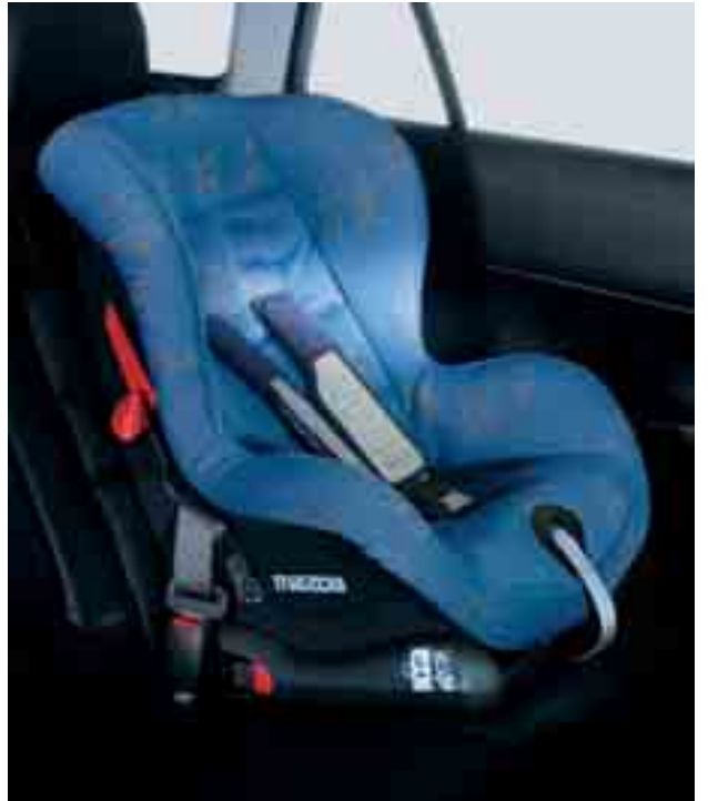
Child seats with standardised ISOFIX DIN brackets.

The Mazda6 is designed around you – and with the extensive range of Mazda6 accessories, you can create your own unique driving experience.