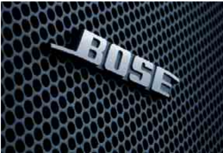
Bose Premium Audio System – Standard on TS 2 and Sport models.