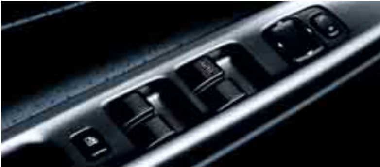
Titanium trim on window switches.