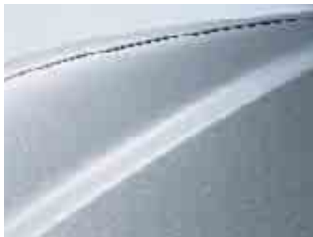
Metallic paintwork options.