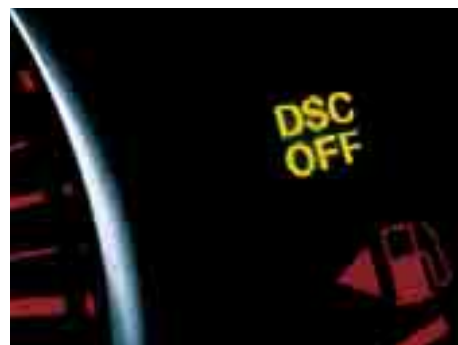
Traction Control System (TCS)* Dynamic Stability Control (DSC)* with Emergency Brake Assist (EBA)*.