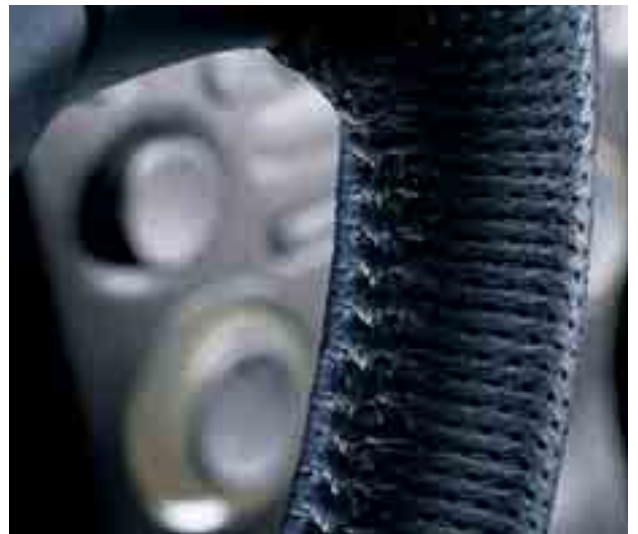
Leather steering wheel*.

The Mazda6 with that little bit extra – the Touring-Sport (TS) gives you a driving experience which is a cut above the rest.