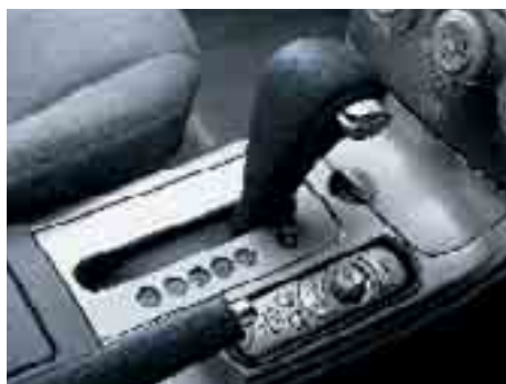
Four-speed automatic transmission † with optional DVD navigation system remote control unit †