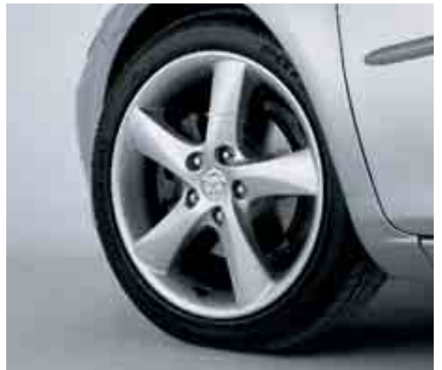
17" 5-spoke alloy wheels standard on 2.3i Sport models.

The Mazda6 Sport is packed full of features to get your heart racing. Petrol models feature a 2.3-litre 166ps engine and all Sport models include the Bose Premium Audio System with 6-disc CD autochanger and seven speakers, including a subwoofer. An individual appearance is provided by striking xenon headlights (with automatic headlight levelling control and a high-pressure headlight cleaning system), plus the sporty, stylish, 17" alloy wheels*. Sport models also feature metallic paint at no additional cost.