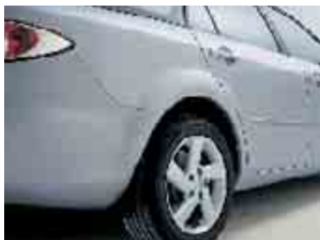
Automatic levelling suspension for the Mazda6 2.3 Estate Sport**.