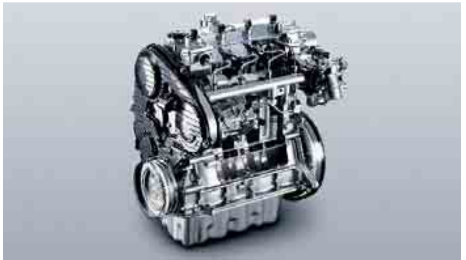
Pictured is the 2.0-litre MZR-CD engine.

What powers this spirited family car? Three newly developed MZR aluminium four-cylinder petrol engines with 1.8, 2.0 or 2.3-litre capacity, giving you extremely low levels of noise and vibration, smooth running and economical fuel consumption.