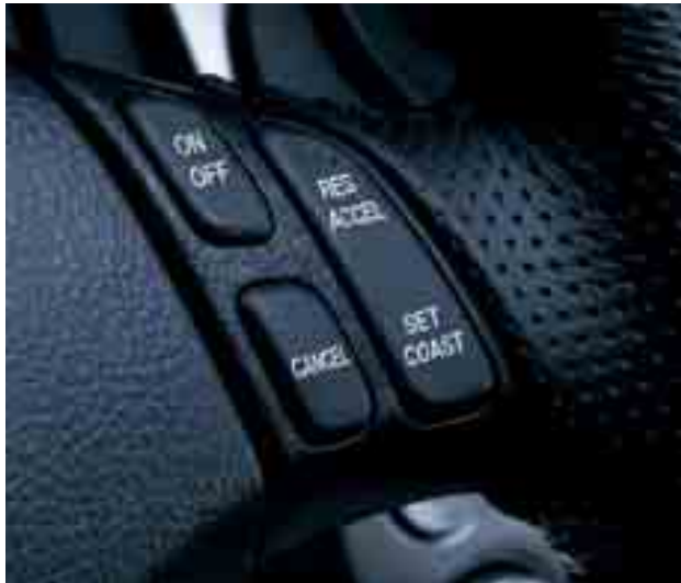
Cruise control steering wheel switches*.