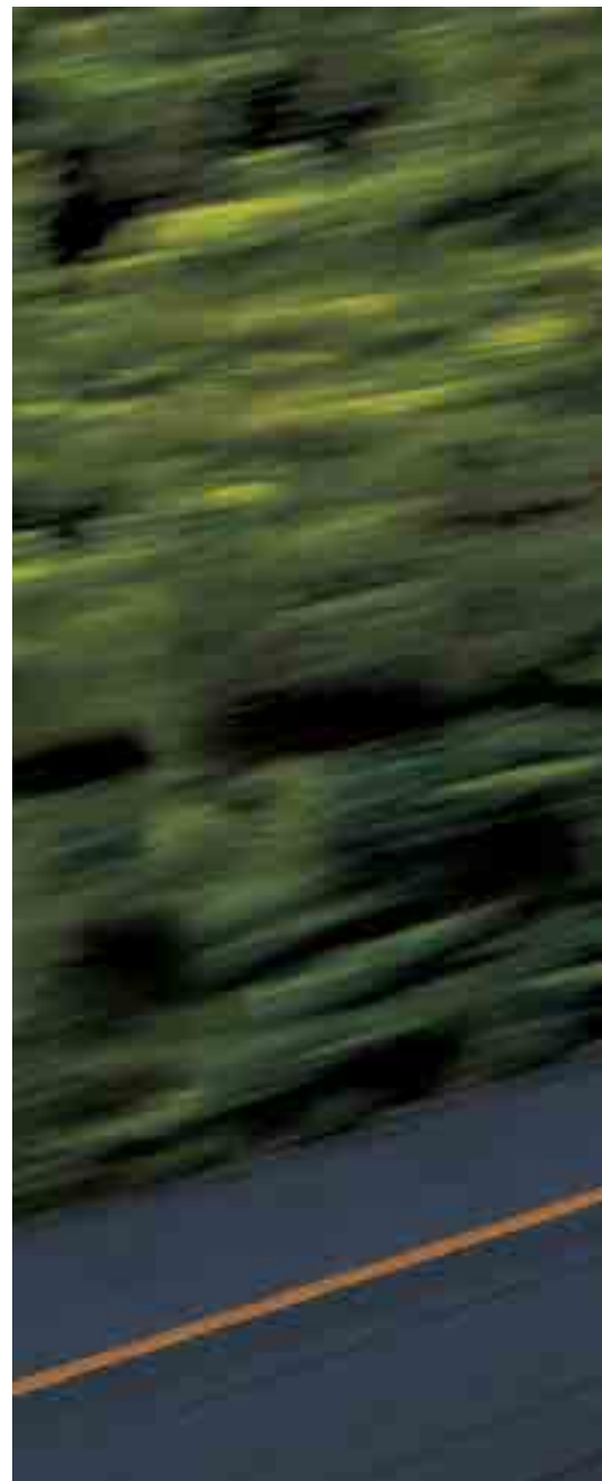
Vehicle not to UK specification.