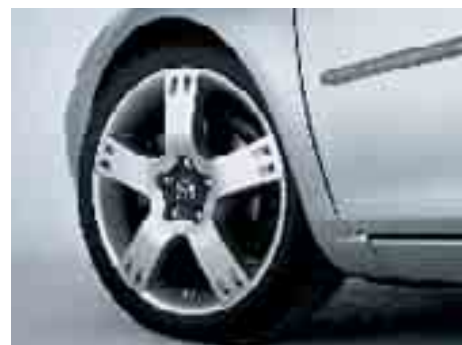
17" accessory alloy wheels.