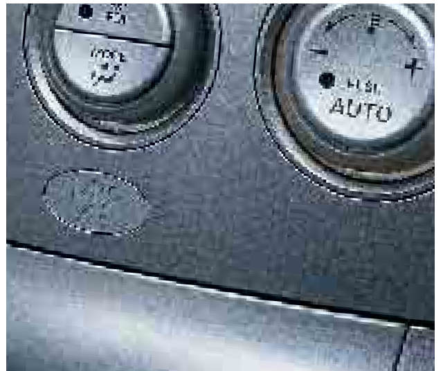
Climate control air conditioning*.

Mazda vehicles have always held an industry-leading reputation for durability, quality and reliability. Mazda6 is no exception.