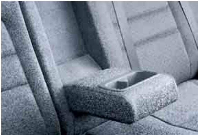
Rear armrest with cup holders*.