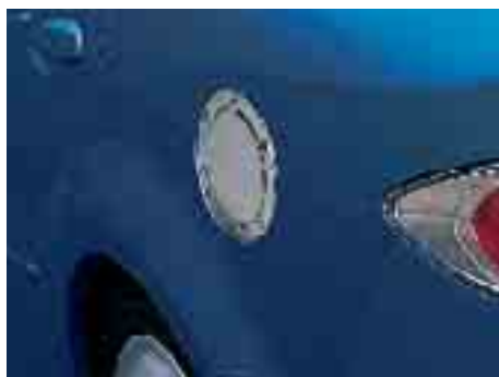
Aluminium fuel filler cap.