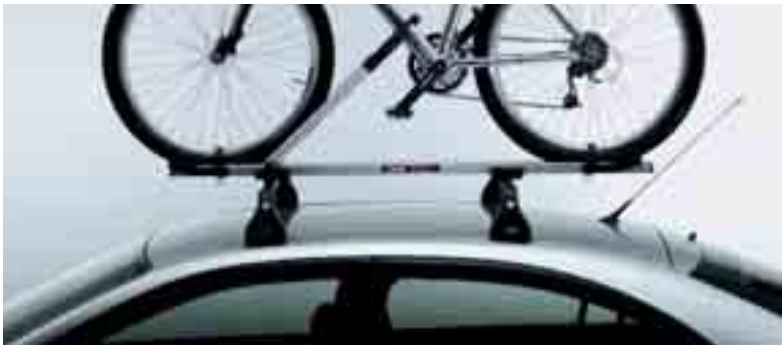
The versatile roof-rack system.