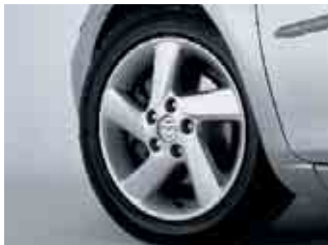
17" 5-spoke alloy wheels.